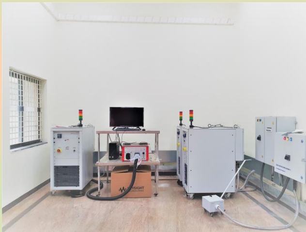
EVSE Test and Research Facility

The National Conference on E-Mobility will bring together experts from academia, industry, and government to discuss the latest developments in electric mobility.